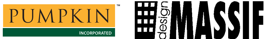
Figure 1: CubeSat Kit Partners

Pumpkin is partnering with design MASSIF to bring you the CubeSat kit.