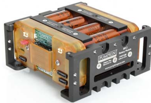
Figure 2: 16V (4S2P), 100Wh, 160W BM2 with optional SUPERNOVA brackets attached