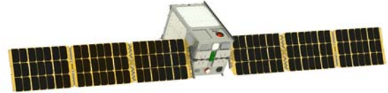
Figure 6: 12U SUPERNOVA EO/IR bus for SMC RROC1 & RROC2 missions