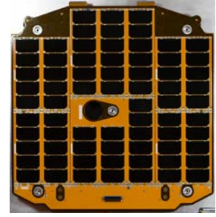
Figure 5: 72W MoonRanger