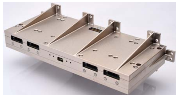
Figure 3: Advanced Modular Power System (AMPS) -- one four-channel slice shown