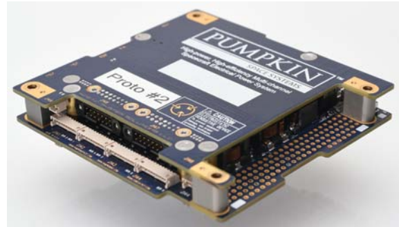
Figure 1: 12-channel EPSM1 -- 6 MPPT inputs, 3V3/5V0/12V/6-48V outputs & BAT1+BAT2